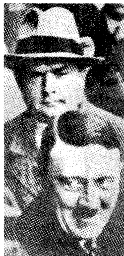
Wagener leaves the Leipzig courthouse with Hitler in September 1930 after having given testimony in the treason trial of the "Ulm lieutenants," three army officers who were prosecuted and convicted for Nazi agitation among the troops.

These memoirs, written during Wagener's postwar internment in a British POW camp, give an unprecedented insight into Hitler's charisma for leadership, his mastery of detail, and his uncanny genius as a tactician and strategist of power. Wagener's controversial views of Hitler and his followers, his eyewitness story of never-before-told details of Hitler's rise to power, are yours in this classic memoir, edited and with an introduction by Yale historian Henry A. Turner, Jr., an expert on the Third Reich. Paperback, index, illustrations, 333 pp. $13.95.